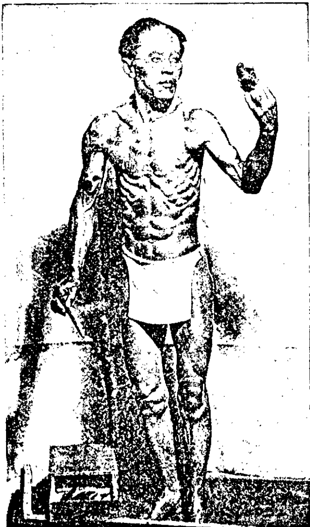
He Posed for Himself and Carved this Image of Himself by the aid of Adjustable Mirrors